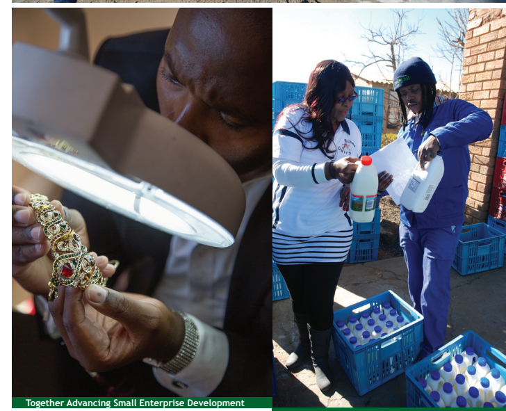
Together Advancing Small Enterprise Development